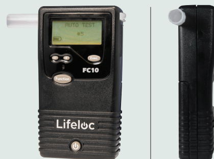
The Lifeloc FC10 fits securely in the hand and is small enough to fit in a shirt pocket.