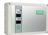
9020 SIL Wall Mount