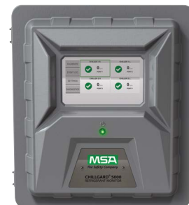
Chillgard 5000 Ammonia Monitor