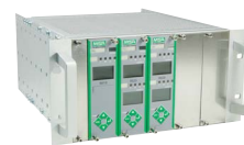
9010/9020 19" rack