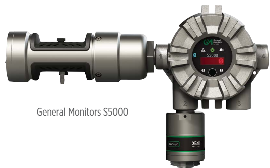
General Monitors S5000