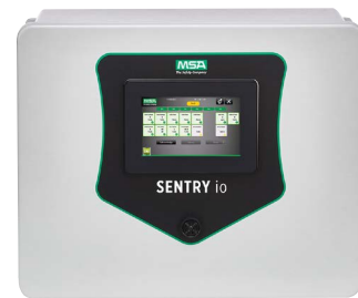
SENTRY io Controller