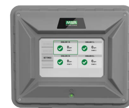
Chillgard 5000 Remote Display