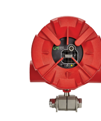
General Monitors® FL500