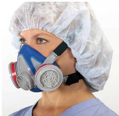
Advantage 200 LS Respirator