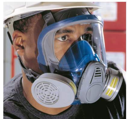
Advantage 3200 Respirator