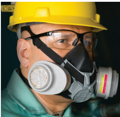
Advantage® 420 Respirator

Organometallic Compounds —These are generally comprised of metals attached to organic groups. Tetraethyllead and organic phosphates are examples.