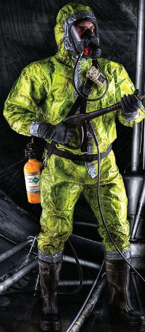
PremAire® Cadet Escape Respirator shown here

Employers must follow the requirements of these governmental regulations, both the general regulations which apply to all workplaces and the specific regulations for exposures in their particular industry, such as lead, silica dust, asbestos, and ammonia.