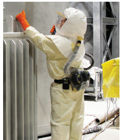
OptimAir® TL Powered Air-Purifying Respirator