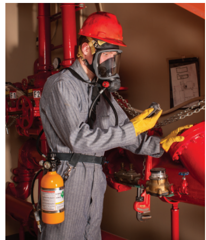
G1 PremAire Cadet Escape Respirator System